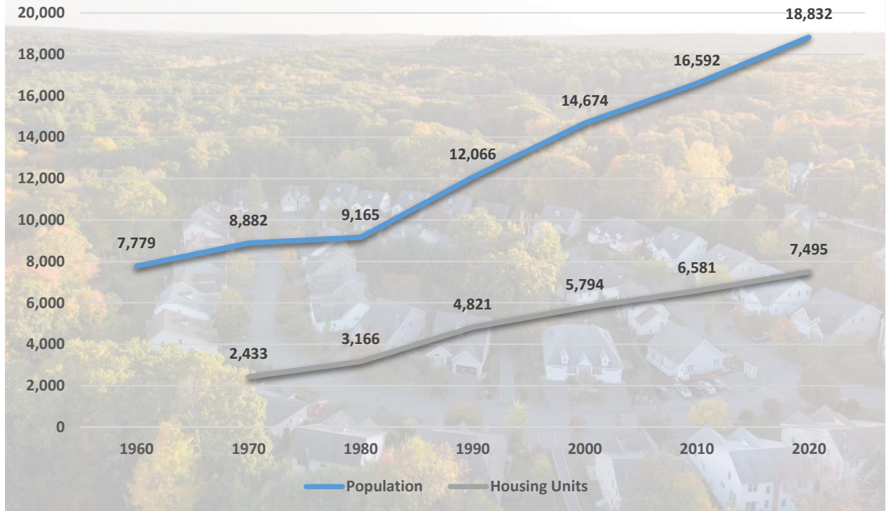
Population and Housing 1960 - 2020