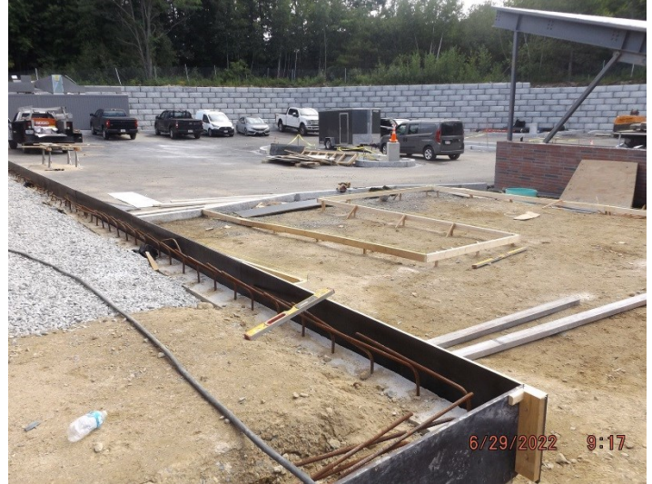
Photo depicts the preparation for concrete sidewalks.