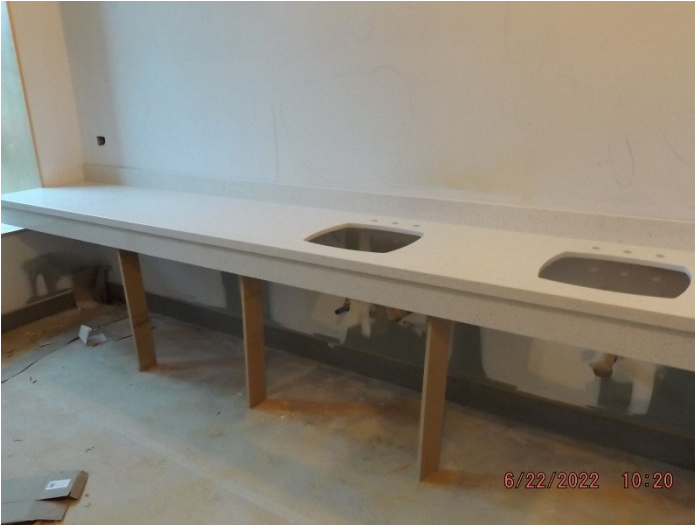
Photo depicts the progress of countertop installation.