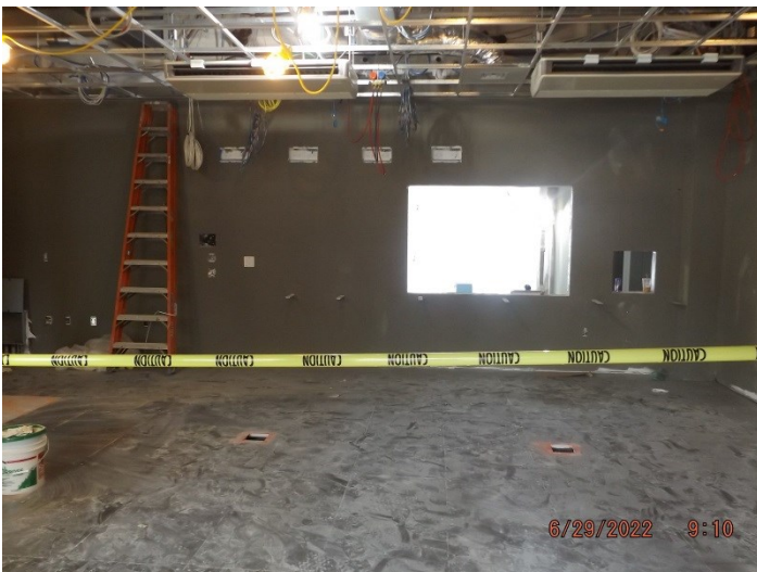
Photo depicts the progress of dispatch.