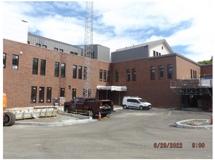
Photo depicts the progress the rear of the admin side of the building.