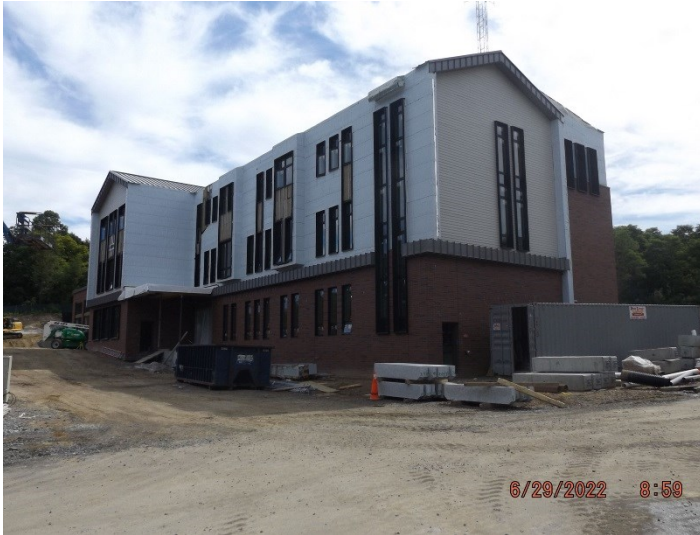
Photo depicts the progress of installation of hardi plank siding, avb over the plywood sheathing for the metal siding.