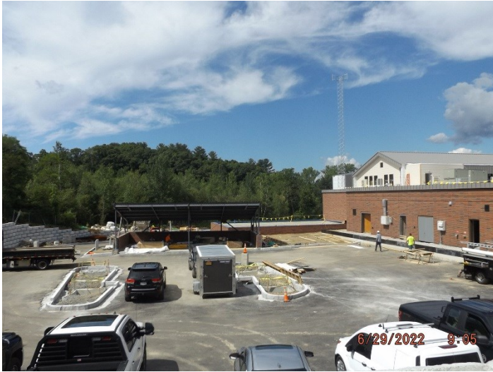
Photo depicts the progress of granite curb installation.