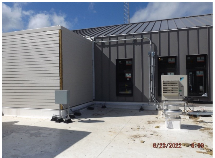
Photo depicts the installation of the solar infrastructure.