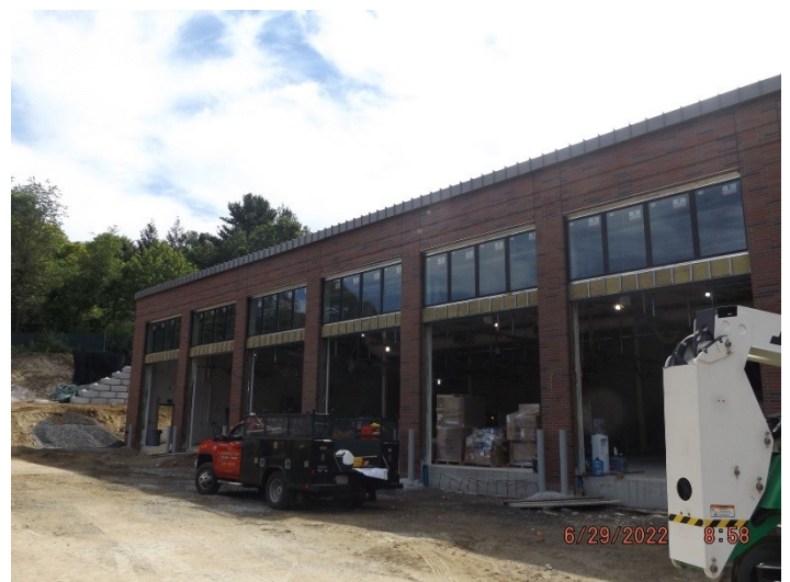
Photo depicts the progress of the exterior of the apparatus bay.