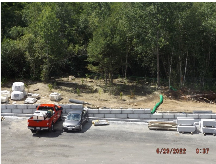
Photo depicts the wetlands replication area.