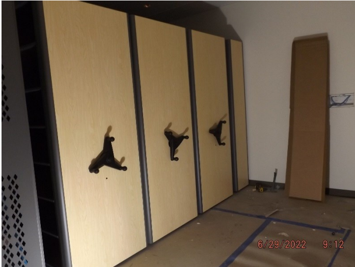
Photo depicts the progress of the mobile storage installation.