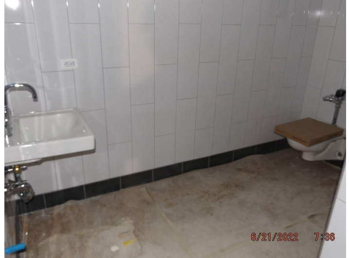
Photo depicts the progress of finish plumbing install.