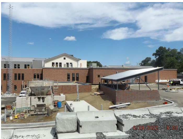
Photo depicts the progress of the exterior at the rear of the fire department side.