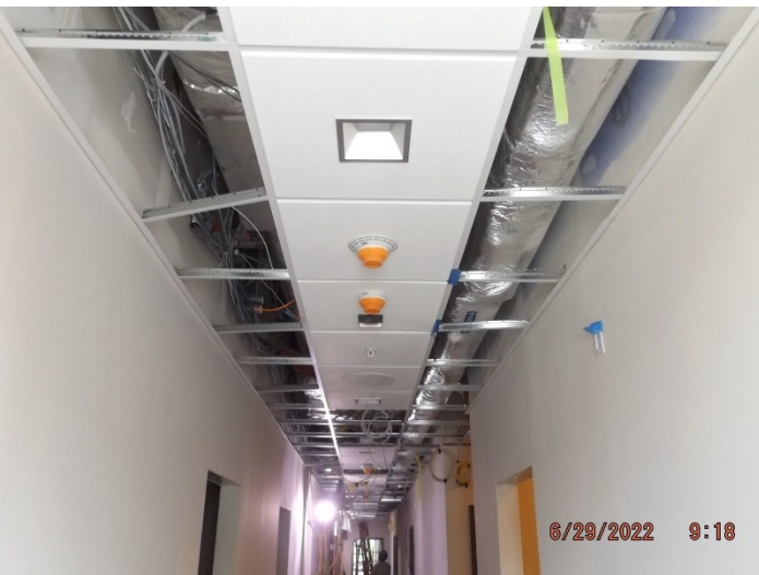
Photo depicts progress of the over head electrical, FP and HVAC finish.