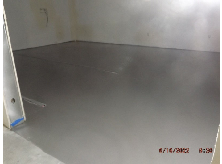
Photo depicts the progress of installation of epoxy flooring.