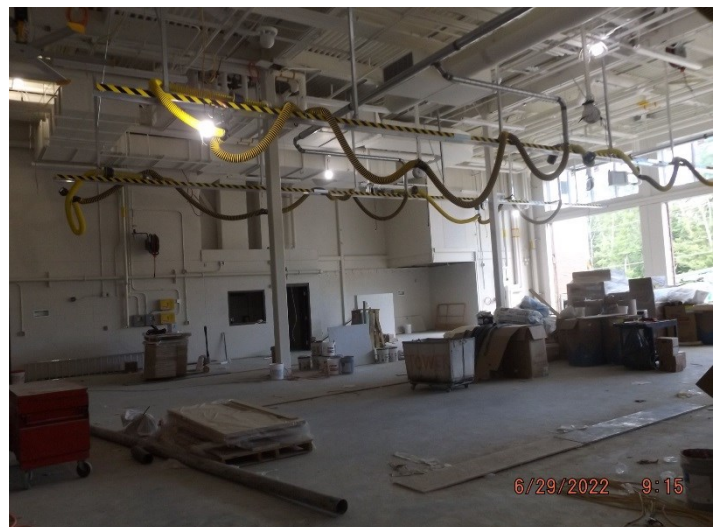
Photo depicts the progress of the apparatus bay.