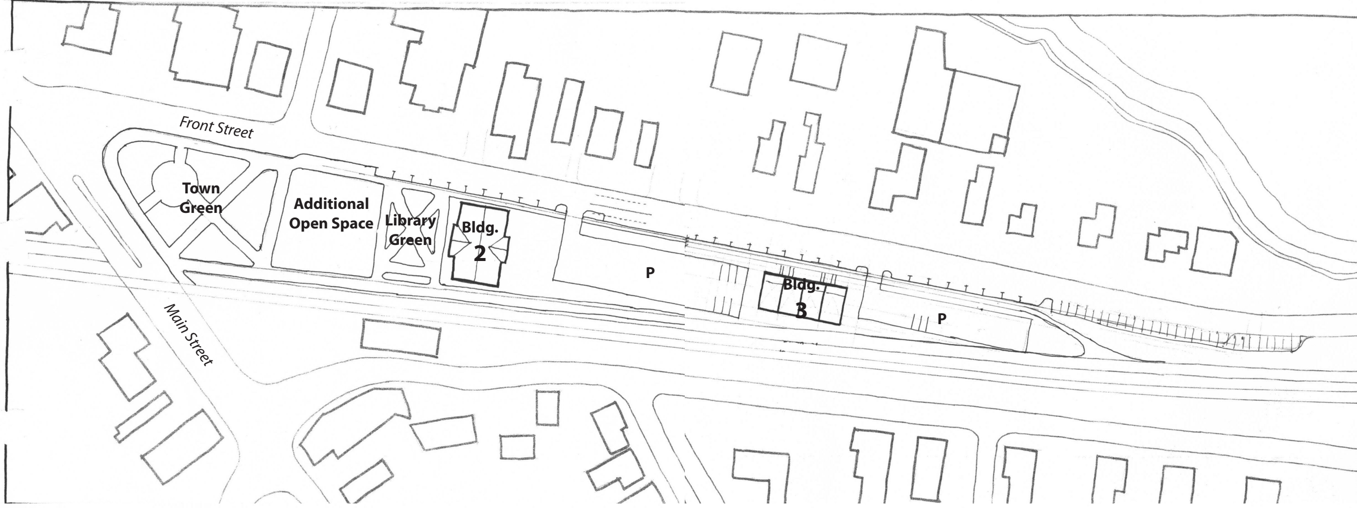
125 Front Street Study Ashland, Massachusetts