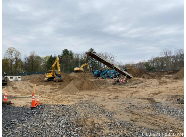
Photo depicts the progress of rock crushing and hauling of material.