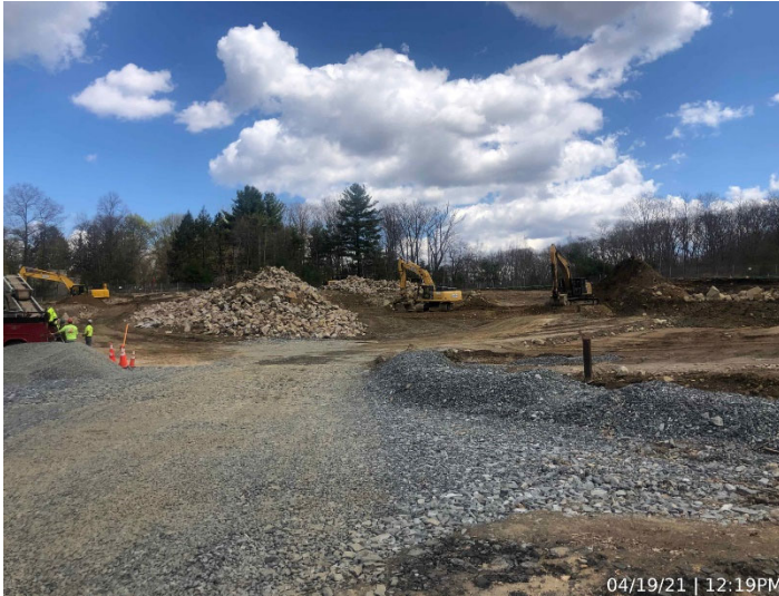
Photo depicts the progress of rock removal.