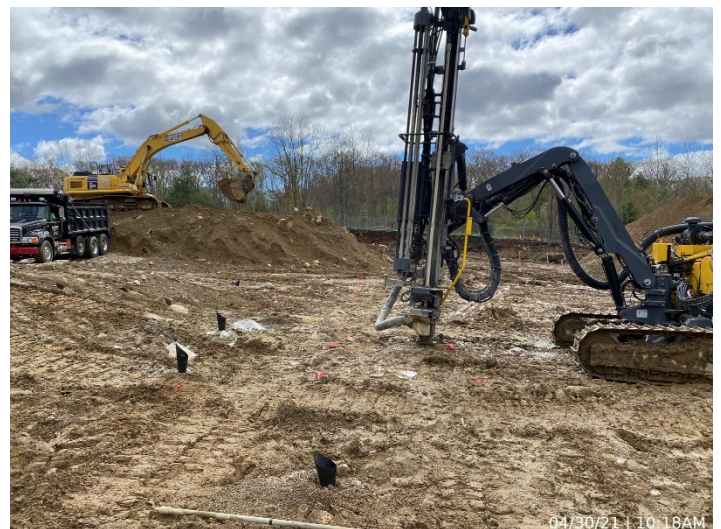
Photo depicts the progress of probing in preparation for blasting along with hauling material off site.