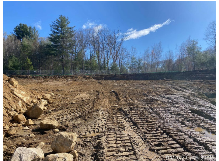
Photo depicts the progress at the rear of the Site