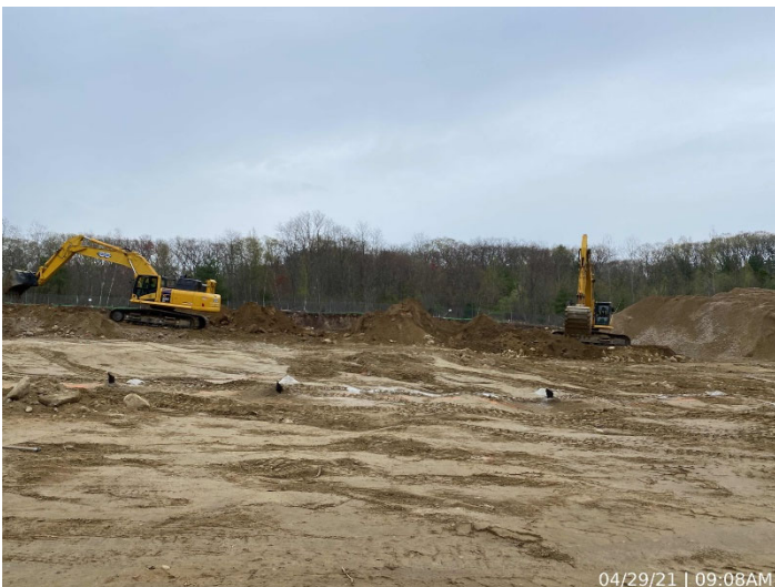
Photo depicts the progress of probing in preparation for blasting.