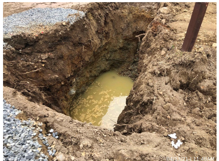
Photo depicts the test pit to determine depth of groundwater.