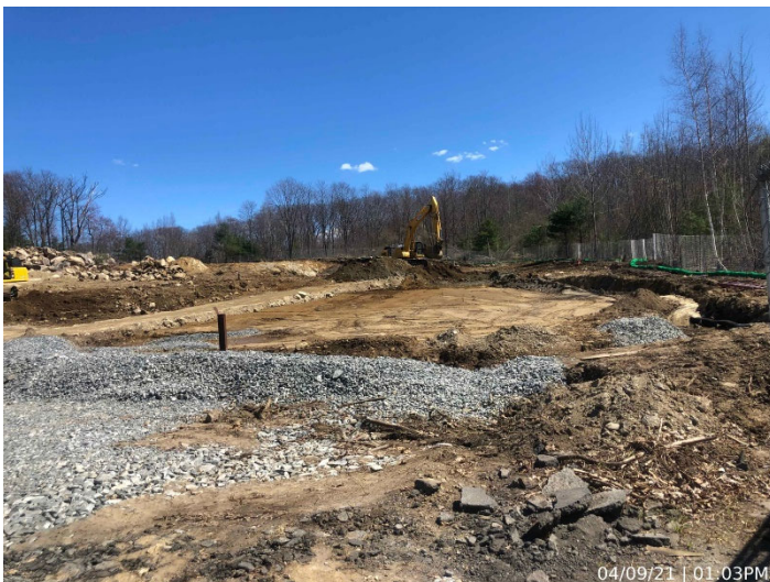
Photo depicts the progress of stock piling of loam