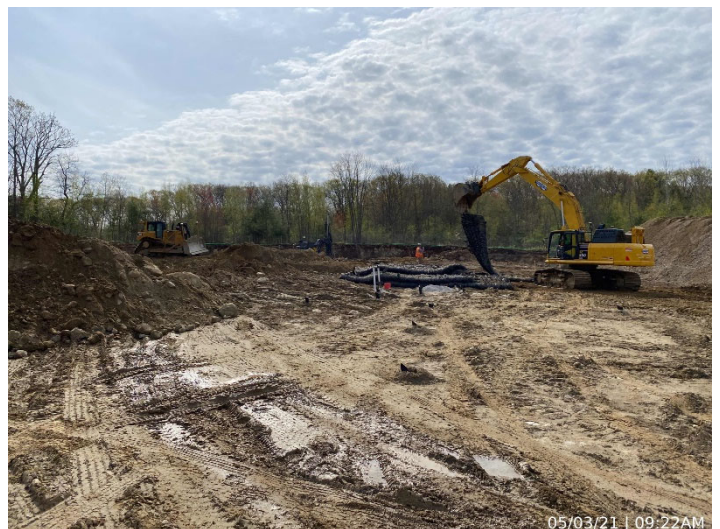
Photo depicts the laying of mats for test blast.