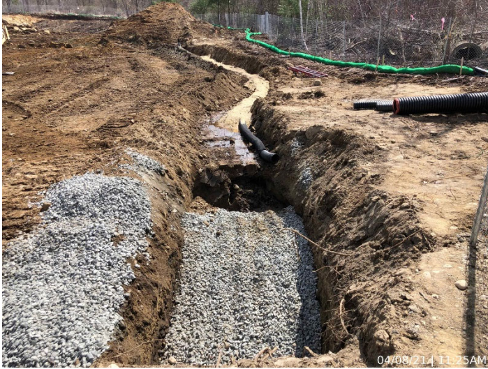
Photo depicts trenching to help direct groundwater.