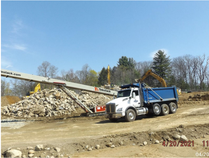
Photo depicts the progress of rock crushing, and hauling of material.