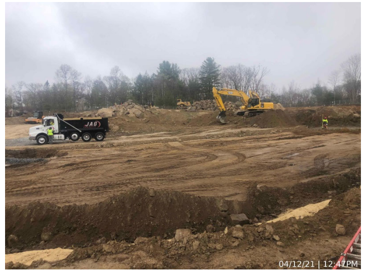
Photo depicts the overall progress of the site.