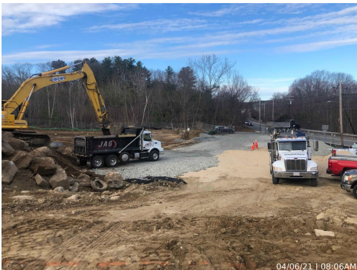
Photo depicts the crushed stone entry for trucking.