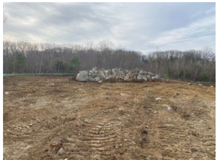
Photo depicts the progress of the Site