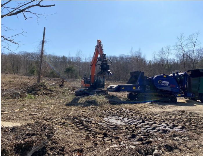
Photo depicts the progress of the Site