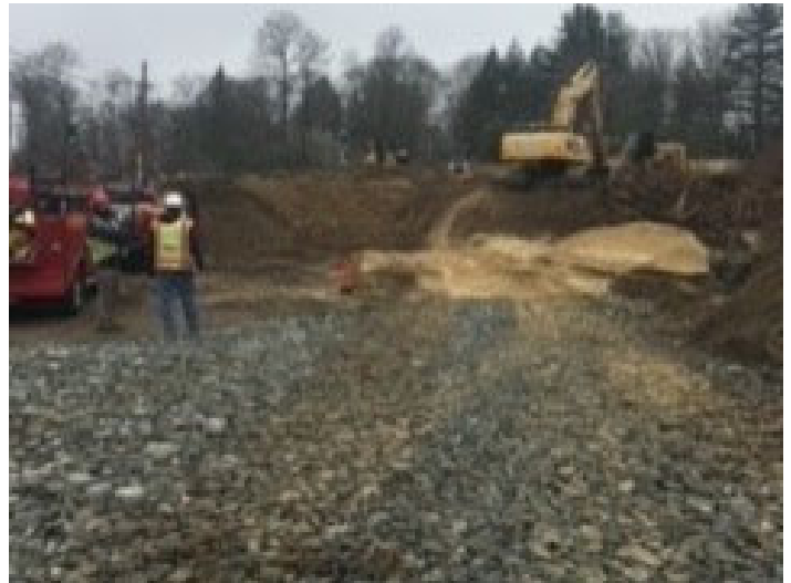
Photo depicts the progress of the Site