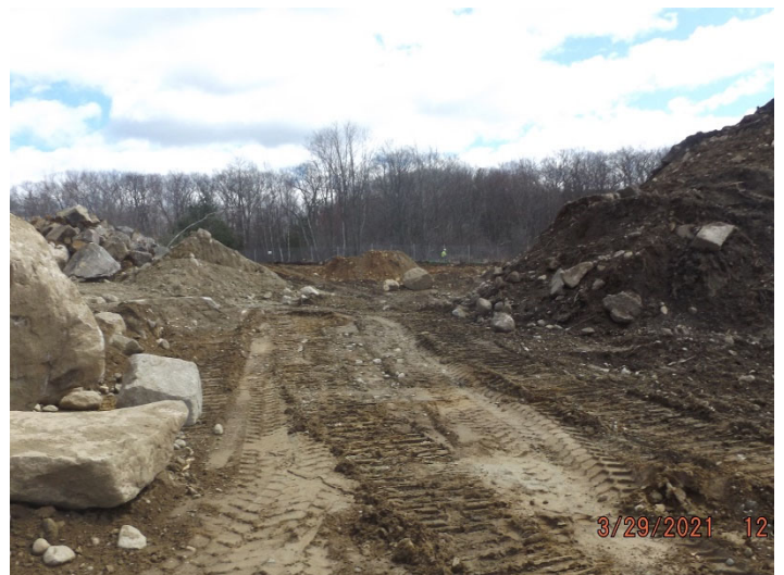
Photo depicts the progress of exterior.