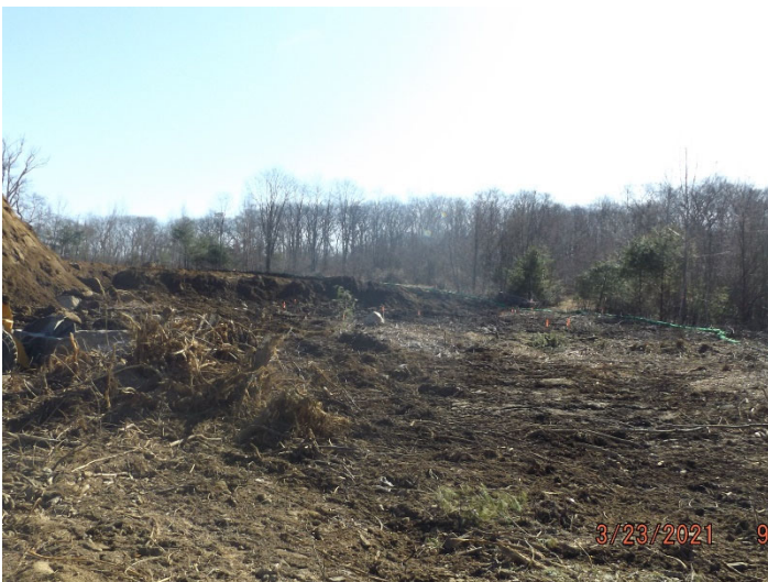
Photo depicts the progress of the Site