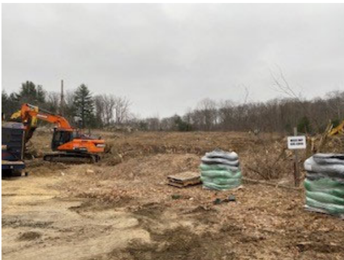
Photo depicts the progress of the site.