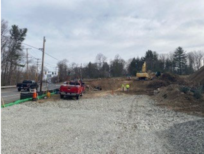
Photo depicts the progress of the Site