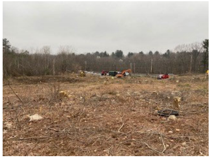
Photo depicts the progress of the Site