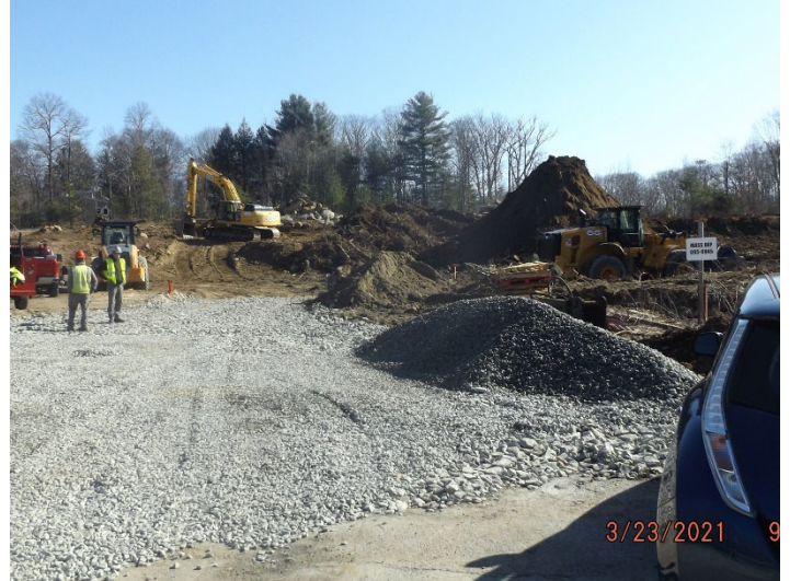
Photo depicts the progress of the Site