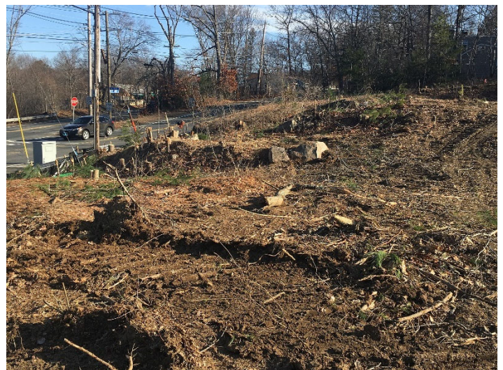
Photo depicts progress of the site.