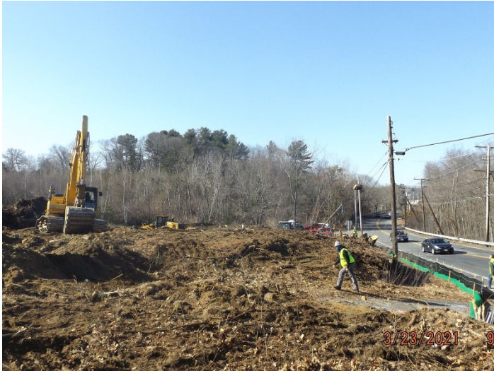
Photo depicts the progress of the Site