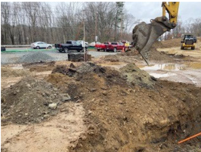
Photo depicts the progress of the Site