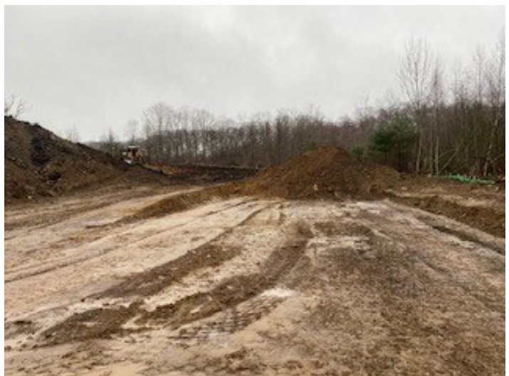
Photo depicts the progress of the Site