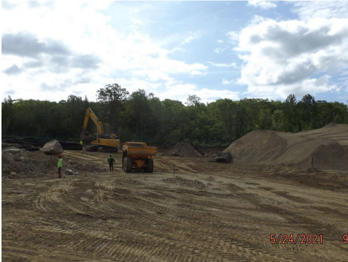
Photo depicts the progress of rock crushing, and stockpiling