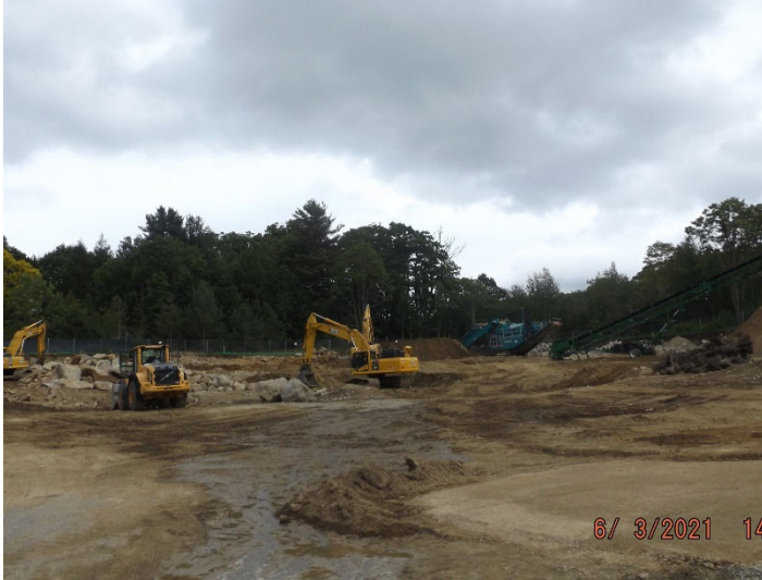
Photo depicts the progress of ledge removal, hammering and crushing.