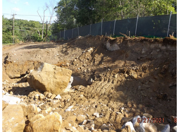
Photo depicts the dislodged ledge after blasting.