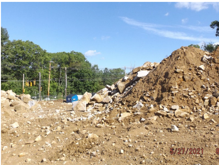
Photo depicts the progress of stock piling of ledge.