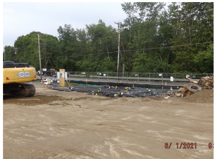
Photo depicts the delivery of rebar for concrete footings.