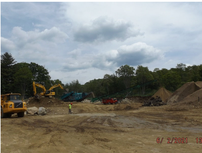
Photo depicts groundwater infiltration.