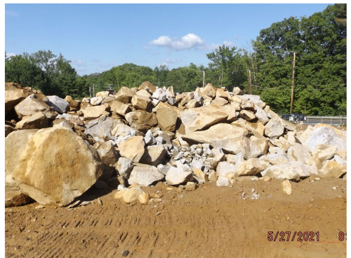
Photo depicts the progress of stockpiling of ledge.