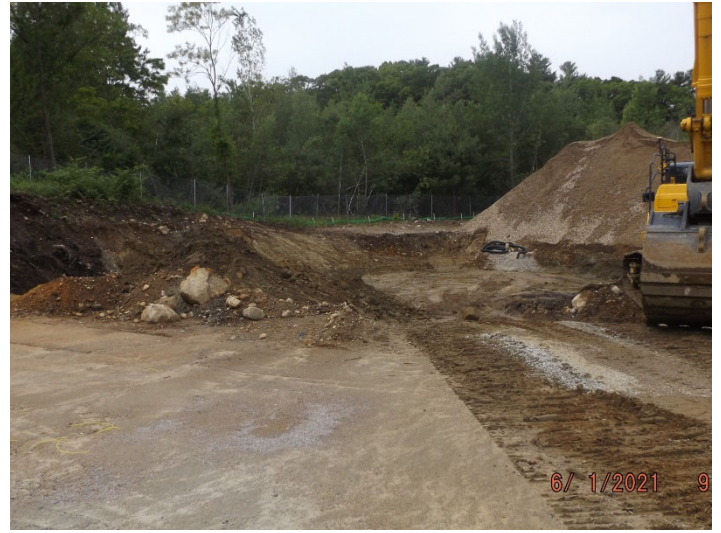
Photo depicts the overall progress of the rear of the site where unsuitable soils were removed.