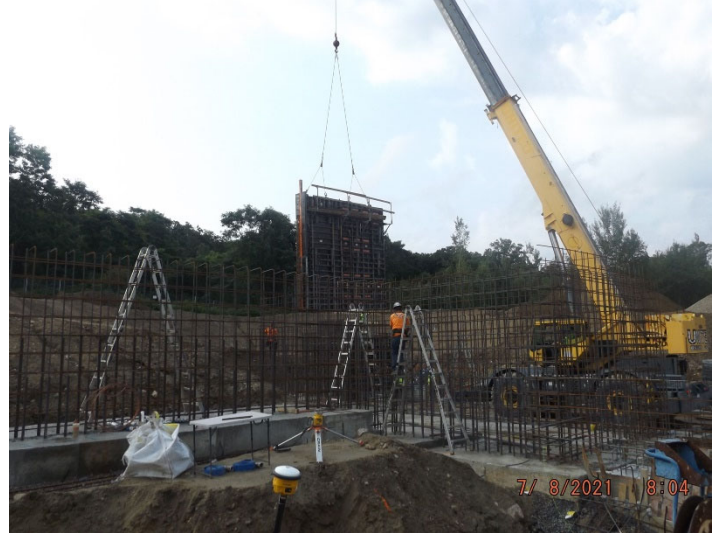
Photo depicts the progress of high wall panel installation.