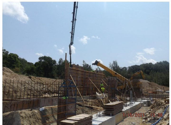
Photo depicts the concrete pour for the high foundation walls.