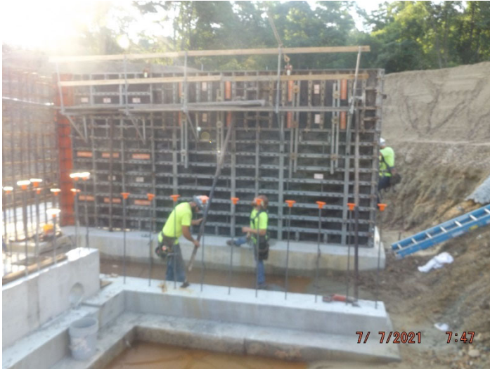
Photo depicts the progress of high wall panel installation.