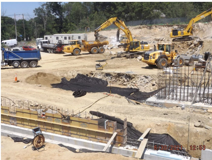
Photo depicts the site progress along with footing and foundation progress.