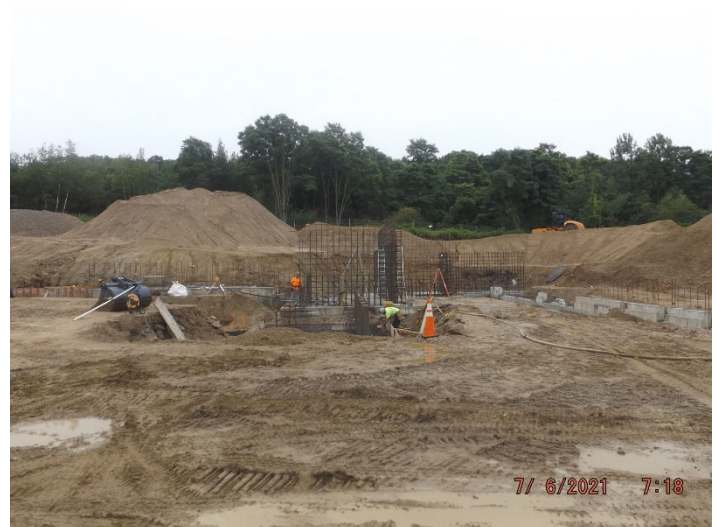
Photo depicts the site progress along with footing and foundation progress.