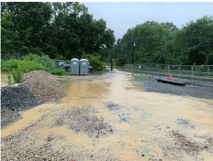
Photo depicts the sediment leaving the site during tropical storm Elsa.