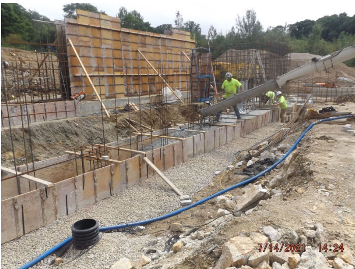
Photo depicts pouring concrete for footings and dewatering of the site.