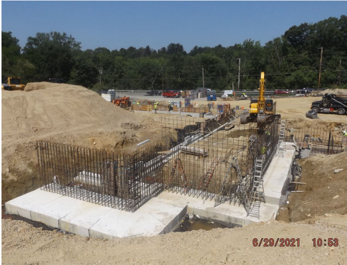
Photo depicts the site progress along with footing and foundation progress.