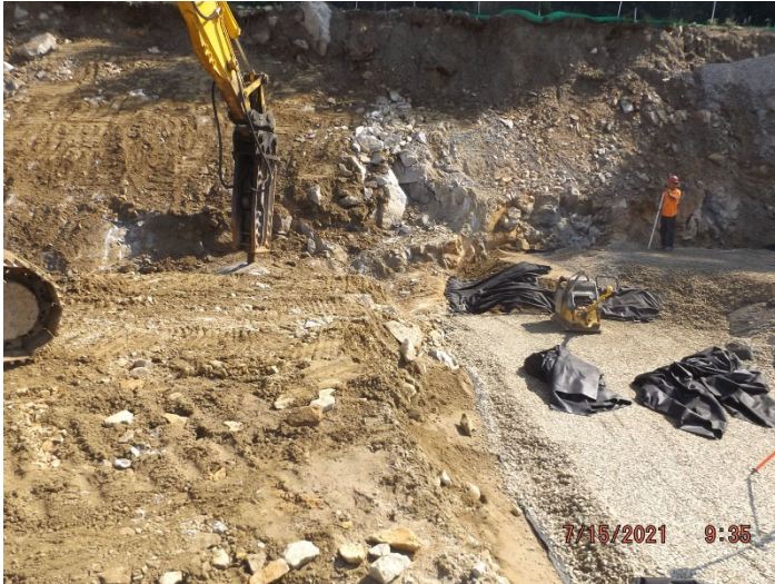
Photo depicts the under footing preparations