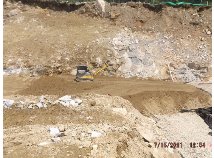
Photo depicts the under footing preparations.