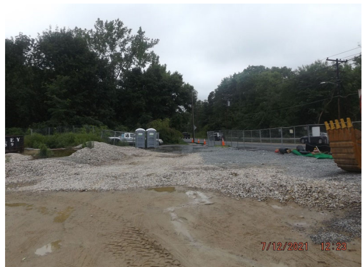
Photo depicts the corrective actions taken to keep erosion and sediment control.