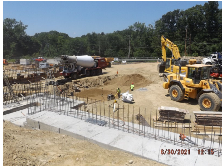
Photo depicts the site progress along with footing and foundation progress.