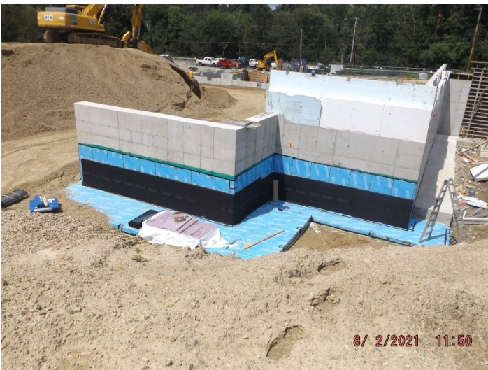
Photo depicts the progress of waterproofing.