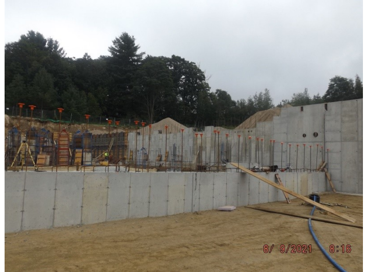
Photo depicts the progress of high wall panel installation.