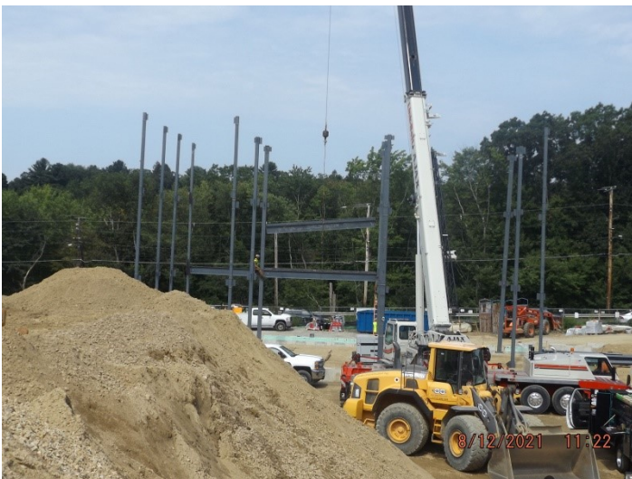
Photo depicts the steel erection.