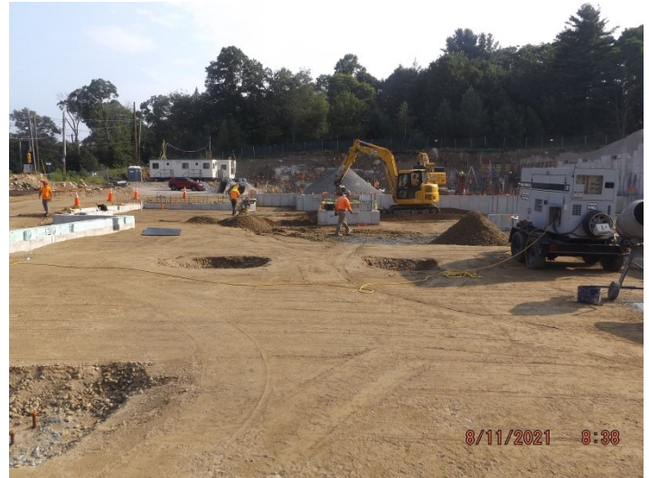
Photo depicts the site progress along with footing and foundation progress.