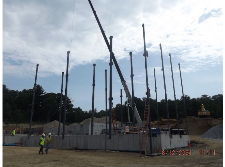
Photo depicts the steel erection.