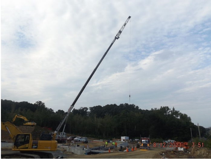
Photo depicts the arrival of the crane for steel.