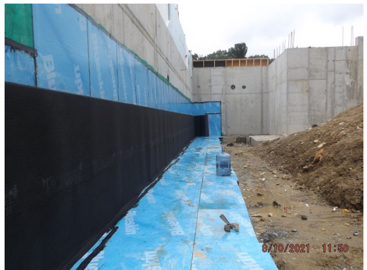
Photo depicts the progress of waterproofing.