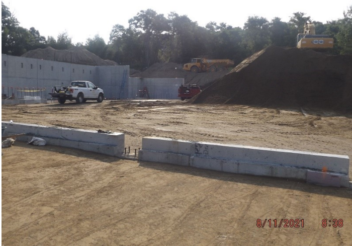
Photo depicts the site progress along with footing and foundation progress.