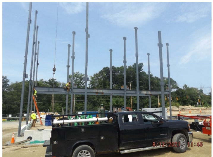
Photo depicts the steel erection.