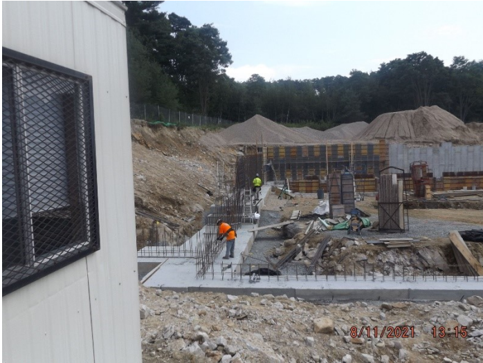
Photo depicts the progress of high wall panel installation.