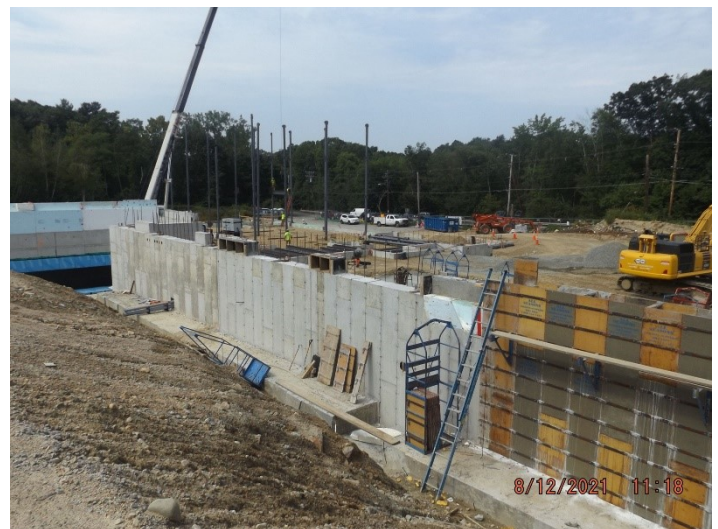
Photo depicts the site progress along with footing and foundation progress.