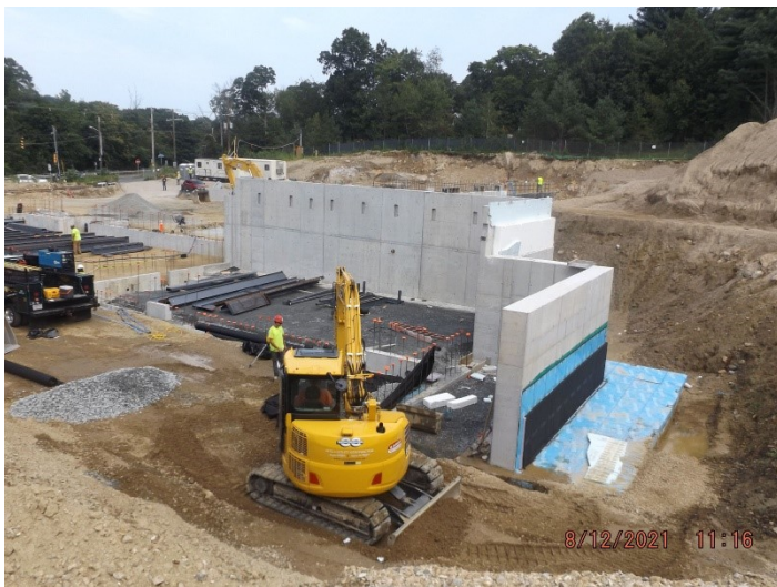
Photo depicts the site progress along with footing and foundation progress.