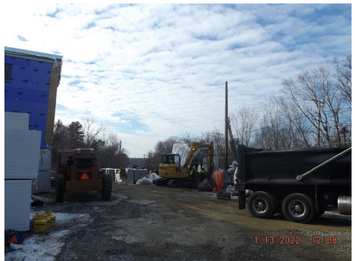
Photo depicts the progress of the front of the site along with the completion of utility pole installation.