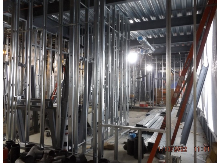
Photo depicts the progress of the first floor framing, plumbing, electrical and HVAC.