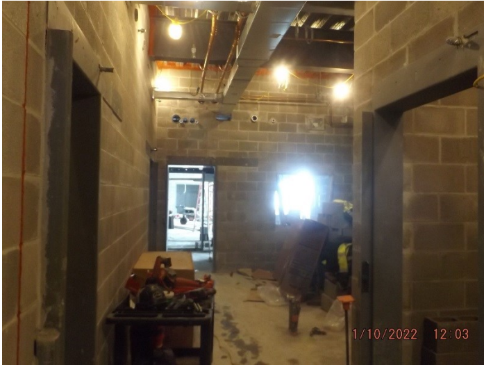
Photo depicts the progress of the detention area.