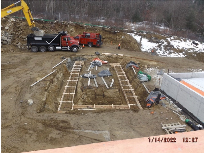
Photo depicts the progress of preparation for the carport footings.