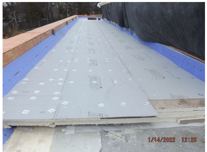
Photo depicts the progress of the apparatus bay roof.