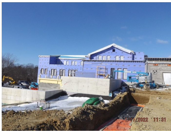
Photo depicts the progress of the exterior sheathing, blocking, and roofing.