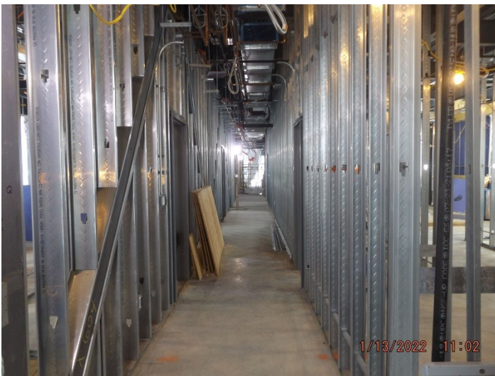
Photo depicts the progress of second floor framing, fire protection, plumbing, electrical and HVAC.