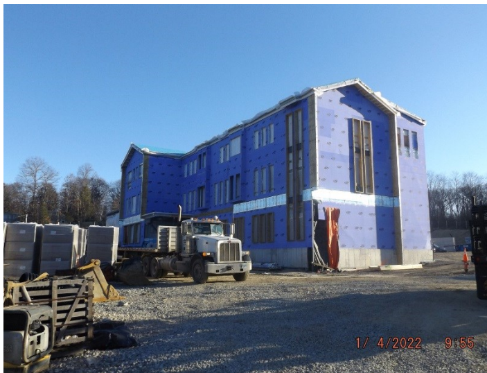
Photo depicts the progress of the exterior sheathing and blocking and AVB.