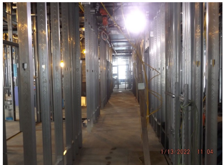
Photo depicts the progress of the second floor framing, fire protection, plumbing, electrical and HVAC.