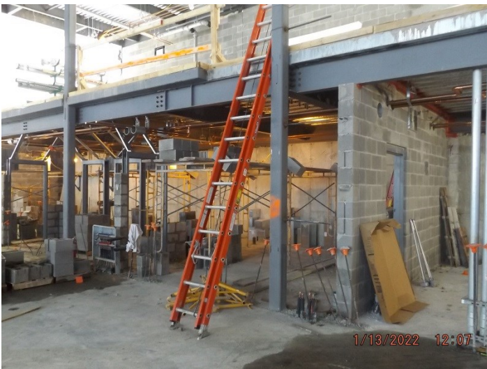
Photo depicts progress of the Apparatus bay support rooms.