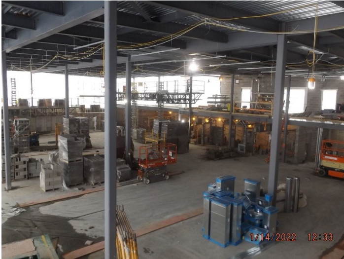
Photo depicts the progress of the apparatus bay.