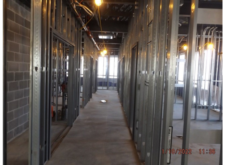
Photo depicts the progress of the third floor framing, fire protection, electrical and HVAC