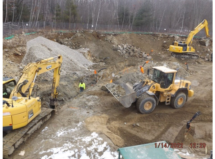
Photo depicts the site progress at the rear of the building and water loop installation.