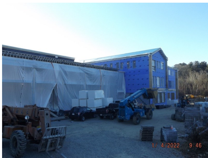
Photo depicts the progress of the parapet framing, sheathing, blocking roofing and temporary enclosure to heat the building.