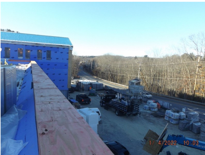
Photo depicts the progress of the front of the site.