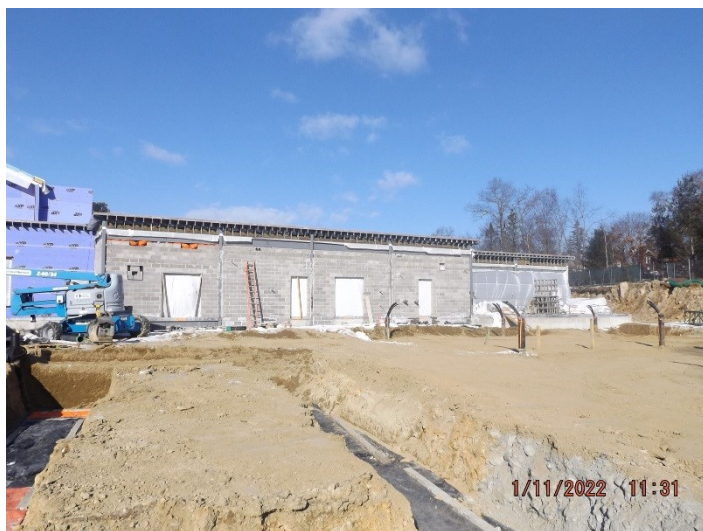
Photo depicts the progress of exterior sheathing, blocking and installation of CMU.