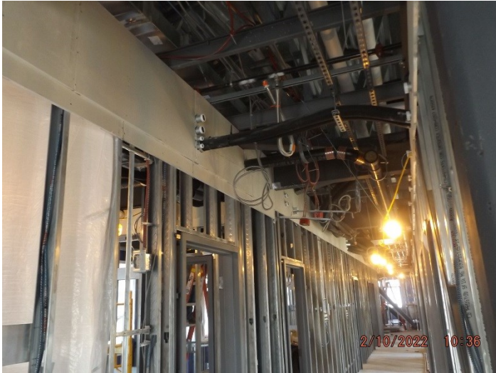
Photo depicts the progress of the third floor framing, drywall, plumbing, HVAC, sprinkler system and electrical.