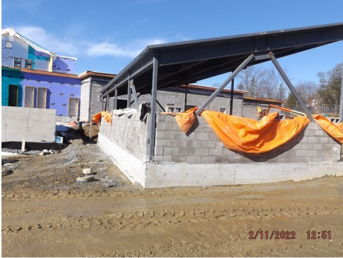
Photo depicts the progress of the carport.