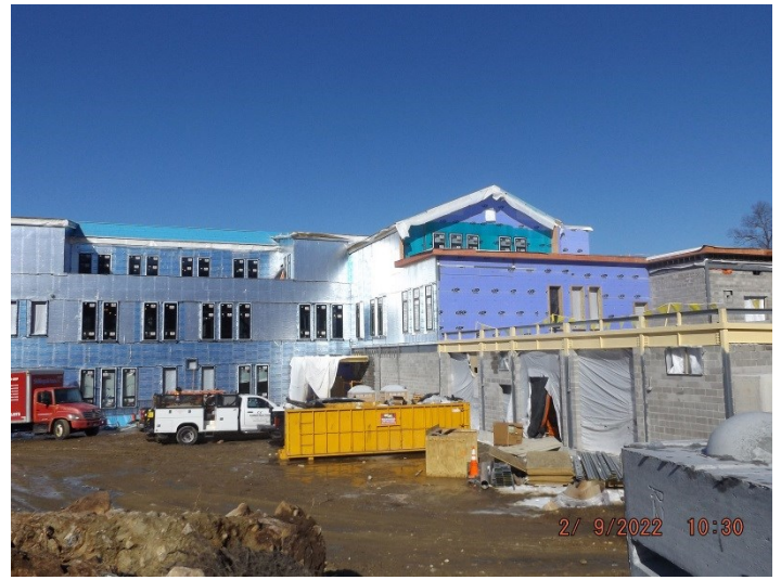
Photo depicts the progress of the AVB, framing and window installation