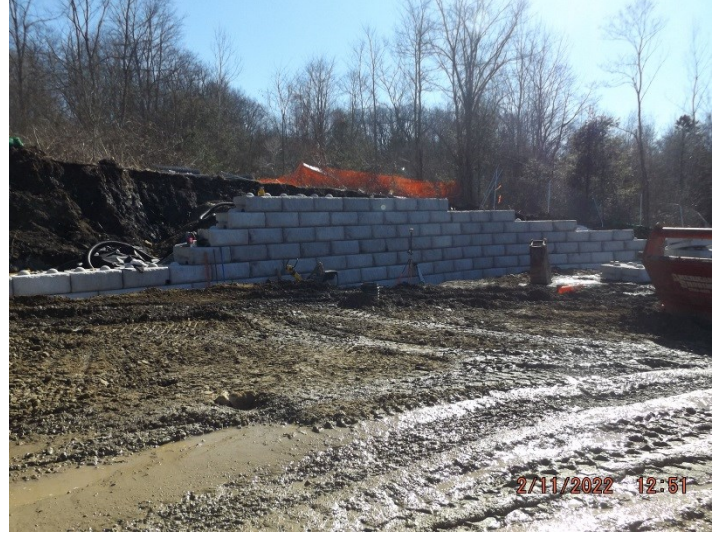
Photo depicts the site retaining wall project from the rear of the site.