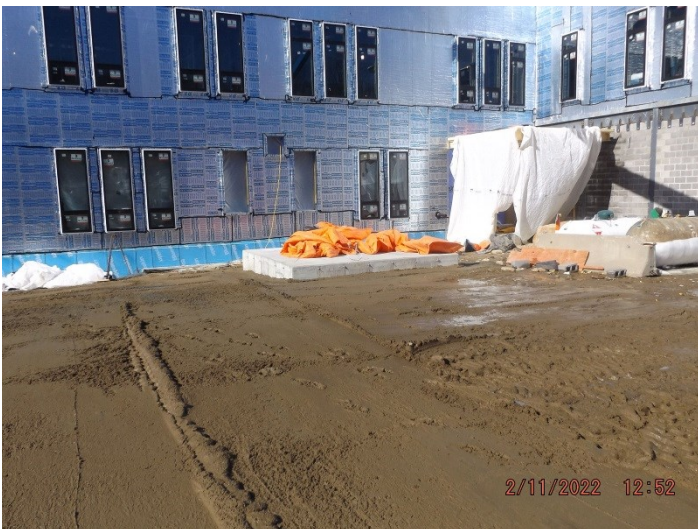
Photo depicts the progress of the antenna tower pad.