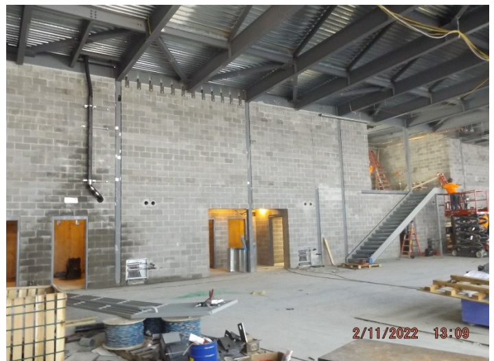
Photo depicts the progress of the apparatus bay.