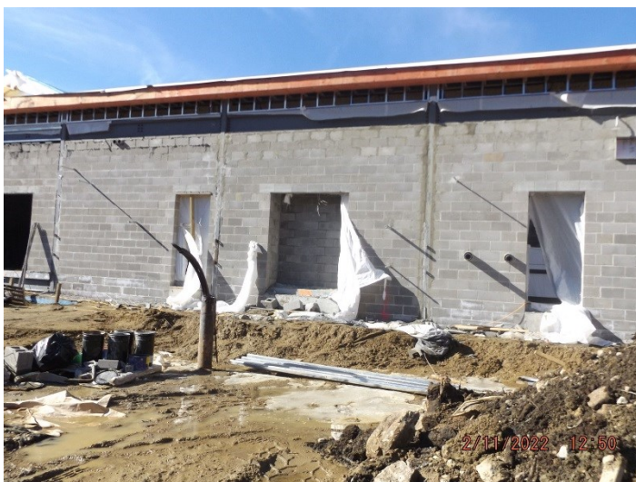
Photo depicts the progress of exterior CMU.