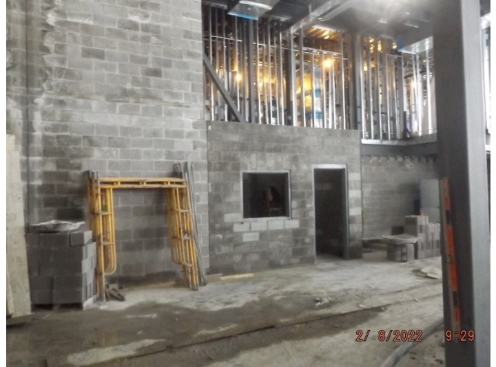
Photo depicts the progress of the apparatus bay and watch room.