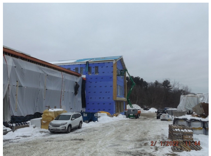
Photo depicts the progress of the parapet framing, sheathing, blocking roofing and temporary enclosure to heat the building.