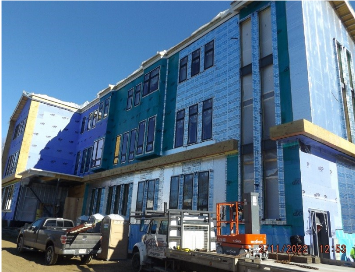
Photo depicts the progress of the AVB, framing and window installation.