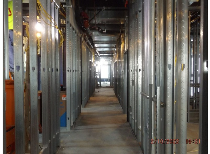
Photo depicts the progress of the Second floor framing, plumbing, HVAC, sprinkler system and electrical.