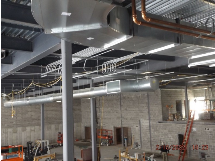
Photo depicts the progress of the apparatus bay.