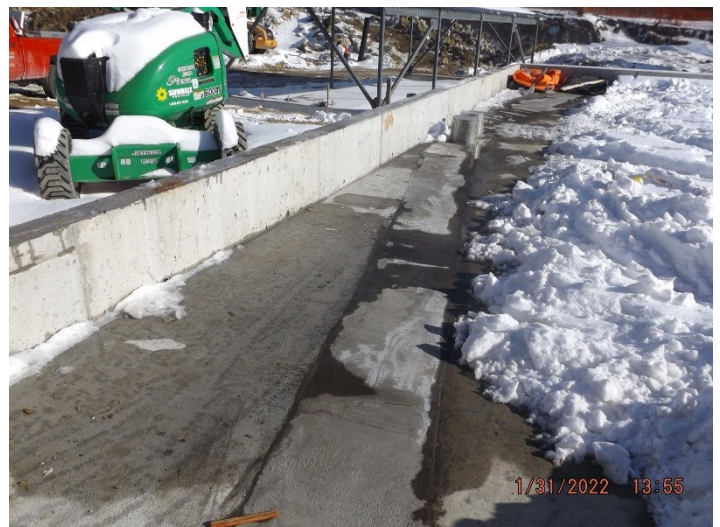
Photo depicts the progress of the second floor green roof.