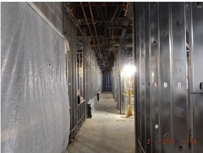
Photo depicts the progress of First floor framing, fire protection, plumbing, electrical and HVAC.