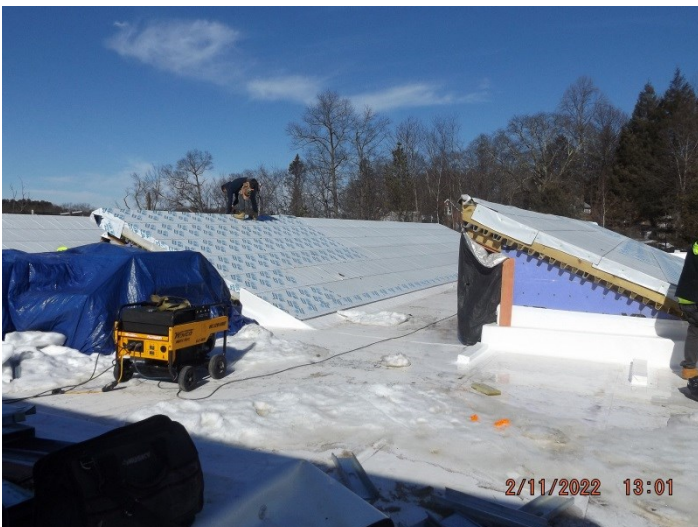
Photo depicts progress of the Apparatus bay roof, framing and roofing of sawtooth roofs.