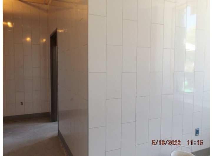
Photo depicts the progress of the Second floor locker room wall tile.