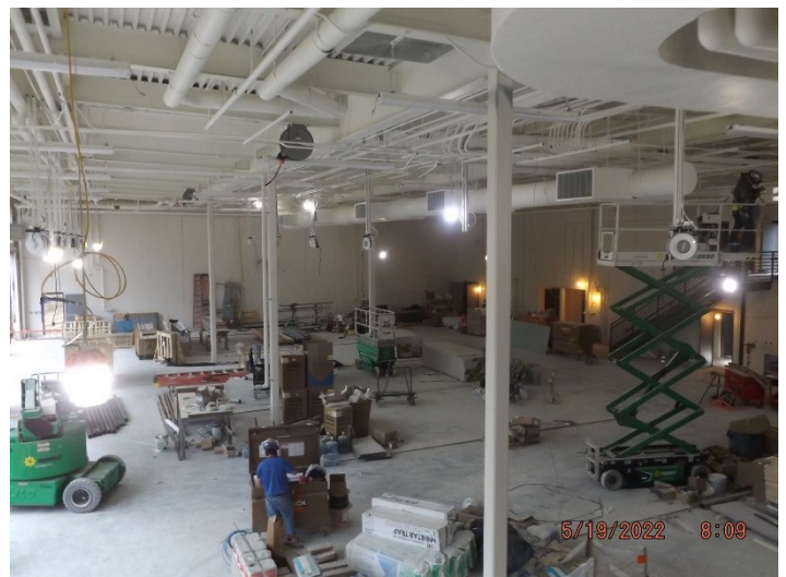
Photo depicts the progress of the apparatus bay.