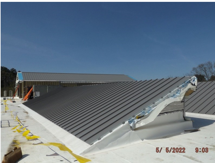
Photo depicts progress of the metal roof.