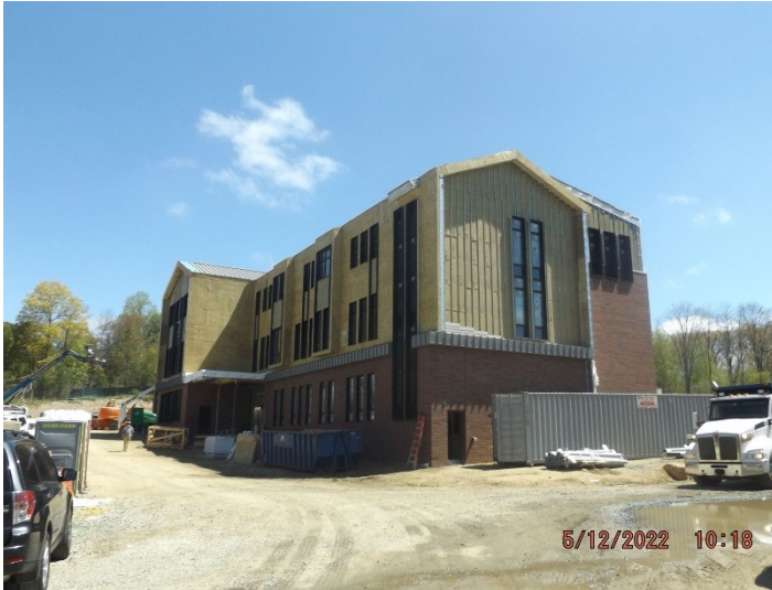
Photo depicts the progress of the framing and insulating for the secondary walls.