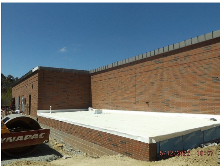
Photo depicts the progress of brick, lower roof and parapet metal.