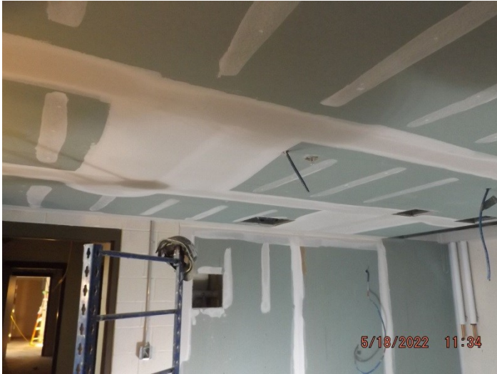
Photo depicts the progress of the apparatus support rooms.