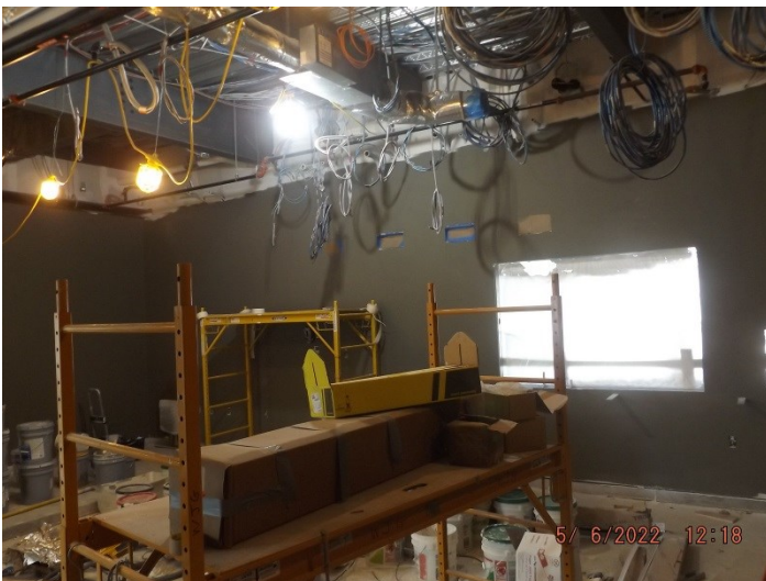
Photo depicts the progress of dispatch.