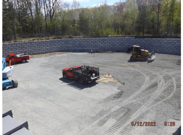
Photo depicts the progress of binder prep at the rear of site.