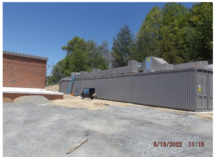
Photo depicts the progress of the shooting range.