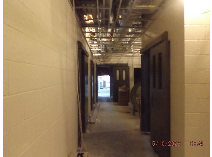
Photo depicts the progress of the detention area.