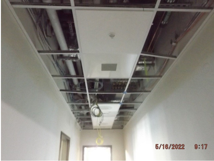
Photo depicts the progress of the third floor finishes—Paint and ceiling grid.