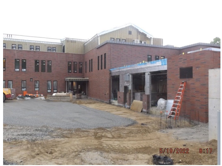
Photo depicts the progress of the brick at the rear of police admin and sally port area.