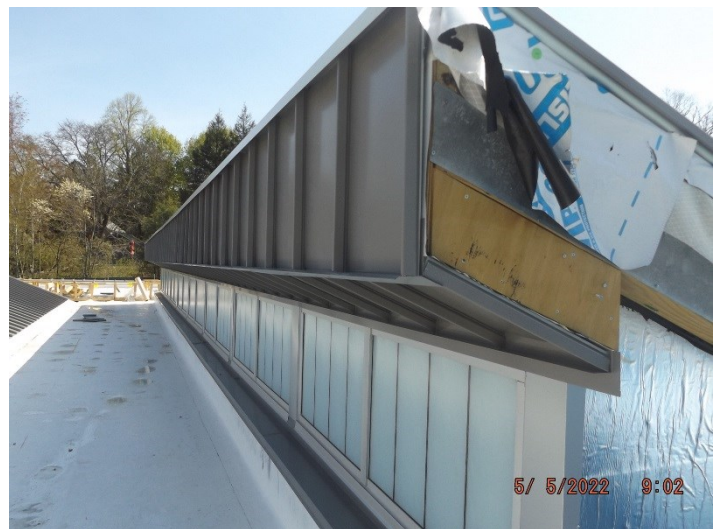
Photo depicts the progress of the metal at sawtooth roofs on the apparatus bay with translucent panels installed.