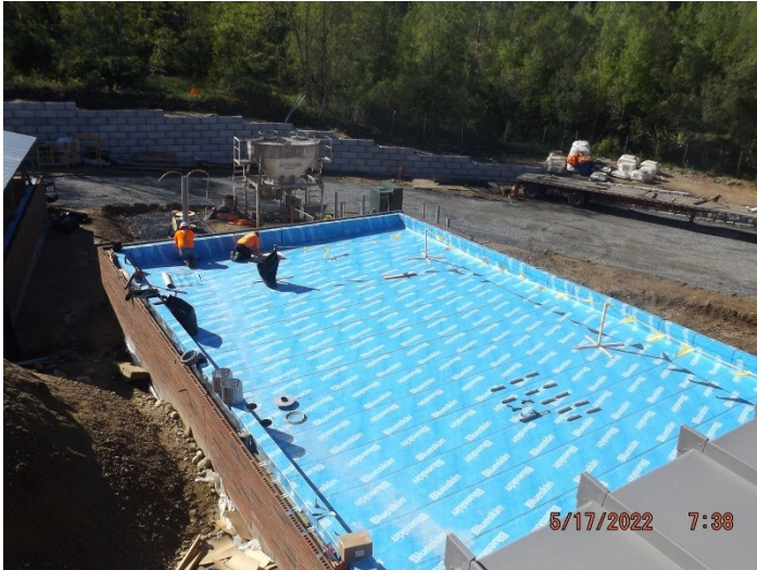
Photo depicts the progress of the lower green roof.