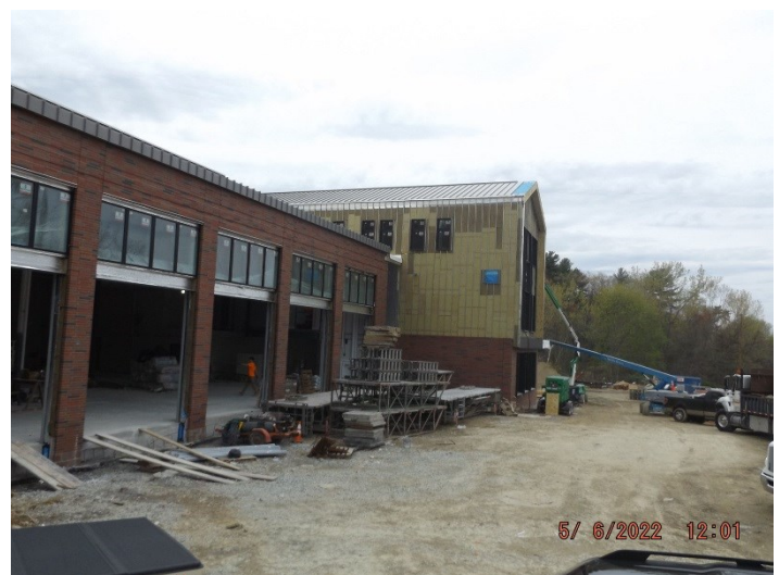
Photo depicts the progress of the brick and window installation at the apparatus bay along with the secondary wall framing and insulation.