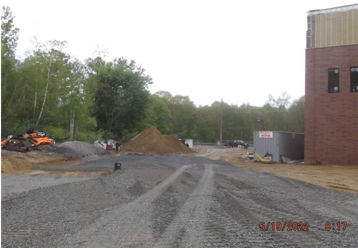
Photo depicts the progress of binder prep heading towards the front of the site.